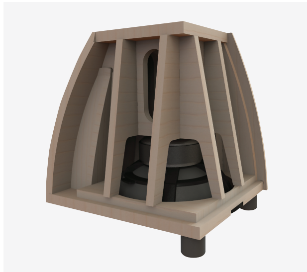
CUTAWAY VIEW SHOWING INTERNAL BRACING

Utilising a 12in driver, the DSW is compact yet capable of very high performance. To manage its level of power, the plywood cabinet is extremely robust, with exceptionally strong internal struts. The driver itself is mounted in a 'nest' of internal ribs that hold it firmly in position for maximum stability and control.